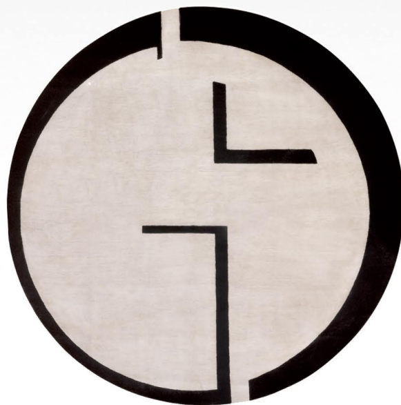
BLACK ON IVORY

MATERIALS IVORY ON BLACK 80% WO, 20% SE BLACK ON IVORY 80% SE, 20% WO