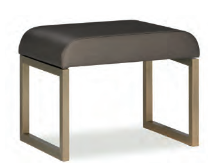
CODE: 048546 CT00A TR593, FARO FABRIC

The Glam stool was born to complete the related coiffeuse and is available in a single size. It has a simple but functional design: the seat features curved sides and tubular metal legs with squared section. Differently from the matching coiffeuse, the stool can be upholstered with different materials - like all suitable Armani/Casa fabrics and Soft Touch Leathers in collection - becoming a multifunctional piece. Fabric covers are removable. MADE IN ITALY.