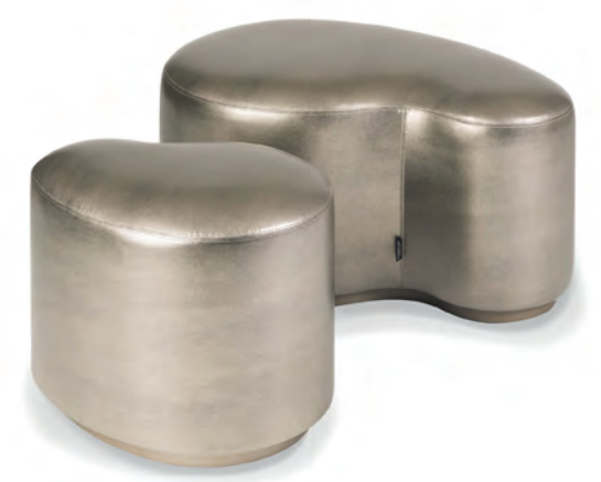
CODE: 048932 TES71 C0041 (SMALL) - 048931 TES71 C0041 (LARGE)

Rounded shape footrest inspired by Luna coffee tables. Available in two different sizes, large and small, that can be matched for several décor options. Upholstery available in all suitable Armani/Casa fabrics, Thin Leathers and Technical Shagreen Fabric. Base in bronze lacquer. This sinuous footrest is particularly decorative if upholstered with Lafayette fabric by Rubelli, featuring a Japanese landscape motif. MADE IN ITALY.