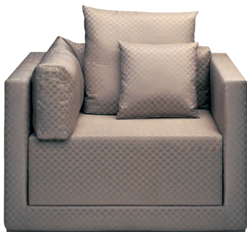
CODE: 045085 CT00D TR177, CLEVELAND FABRIC

The Sydney armchair is, like the sofa, customizable by choosing an exterior frame regularly upholstered with fabric or in Brushed Brown Oak. Cushions in goose feathers. Upholstery can be selected among all suitable Armani/Casa fabrics or Soft Touch Leathers in collection. Fabric covers are completely removable. MADE IN ITALY.