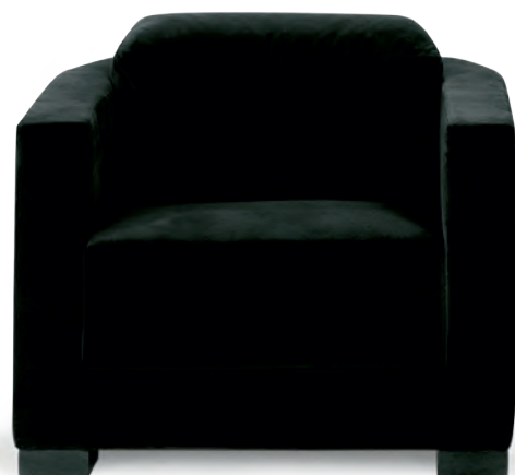
CODE: 045088 RMA0B TR917, MARANELLO FABRIC

Armchair with structure in wood and in multi-density polyurethane foam. Feet in solid brown oak. It can be upholstered with all suitable Armani/Casa fabrics or Soft Touch Leathers in collection. Fully removable fabric covers. MADE IN ITALY.