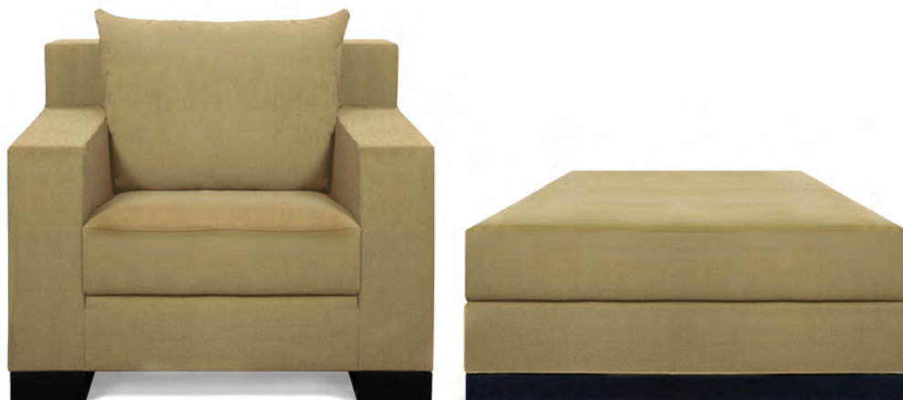
CODE: 045031 RMA0B TR910 (ARMCHAIR), 45032 RMA0B TR910 (FOOTREST), MARANELLO FABRIC

Classic armchair that and footrest that complete the London range. Visible wooden feet. Upholstery available in all suitable Armani/Casa fabrics or Soft Touch Leathers in collection. Fabric covers are removable. MADE IN ITALY.