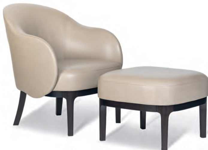
CODE: 049310 CA185 C0554 (ARMCHAIR), 049311 CA185 C0554 (FOOTREST), LEATHER (CUOIO)

Margot is a relaxing armchair with footrest, inspired by the design of the range Lea. The structure is in solid wood with four radiant feet. Differently from the Lea chair, Margot has no decorative zip. Margot introduces a material exclusively available on the Margot range: the top quality Red Soft Leather. The upholstery can be selected in the two bi-elastic fabric Gstad and Dubois, as well as all kinds of leathers in collection (cuoio, Soft Touch, Thin). Padding in foam rubber, inner structure in steel. MADE IN ITALY.