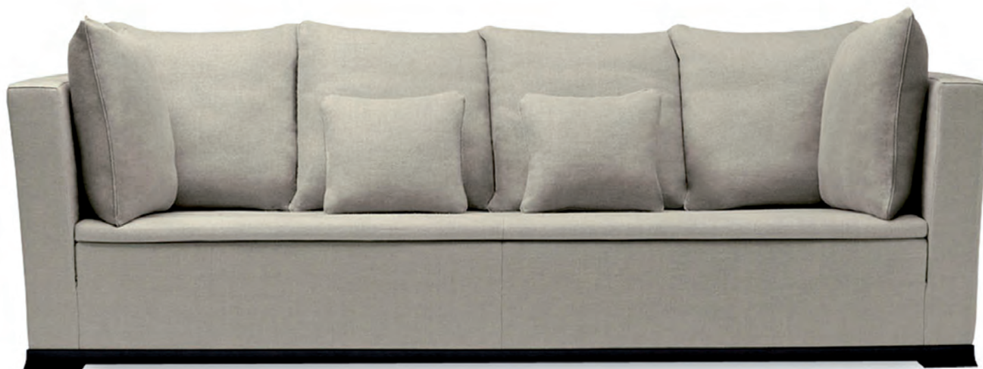
045287 CT00B TR292 (4 SEATS), DETROIT FABRIC