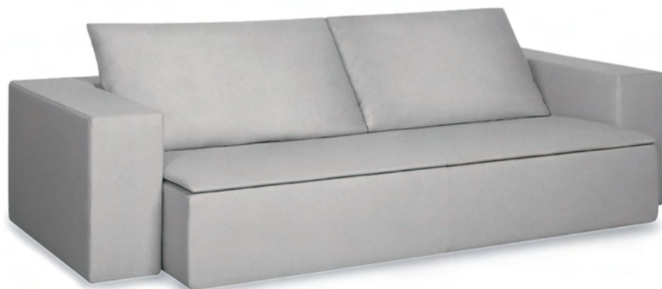
CODE: 045024 CT00B TR908 (PULL-OUT), MARANELLO FABRIC