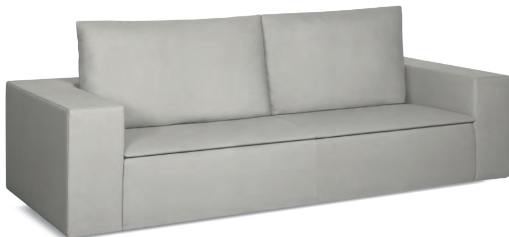
CODE: 045023 CT00B TR908 (STANDARD), MARANELLO FABRIC

Sofa with wide armrests. The linear version can be chosen with two or three seats and it is with pull-out or fixed seating (extra 25 cm). A small table that functions as an armrest cover is also available and can be bought separately. The Grembo range includes two angle composition: the first one features regular armrests on both ends, while the second one presents a left or right meridienne. Covers in all suitable Armani/Casa fabrics or Soft Touch Leathers in collection. Fabric covers are fully removable. MADE IN ITALY.