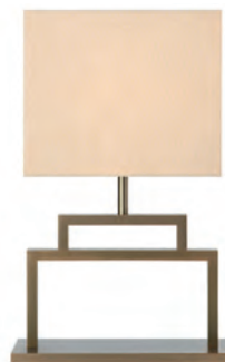
CODE: 049098 xx144 C0058 (BASE) 049099 CA236 C0055 (LAMPSHADE)