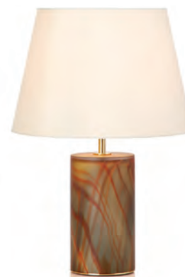
CODE: 049110 xx149 C0099 (BASE) 049111 CA236 C0010 (LAMPSHADE)