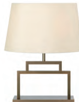
CODE: 049098 xx144 C0058 (BASE) 049100 CA236 C0010 (LAMPSHADE)