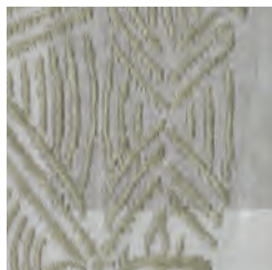
TR727 RED GOLD