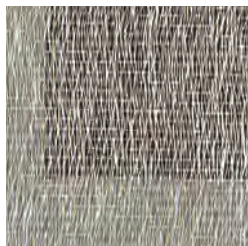
TR691 IVORY SAND