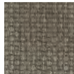
TR689 GOLD BLACK