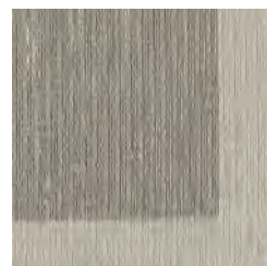
TR683 PALE GOLD