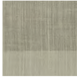
TR387 DOVE GREY