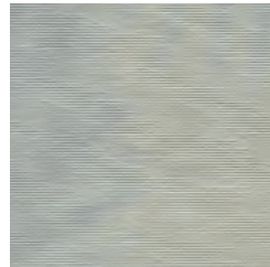
TR721 LIGHT BLUE/BEIGE