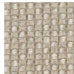
TR815 DOVE GREY