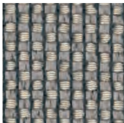
TR817 LIGHT BLUE/IVORY