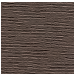
TR664 SEPIA REVERSIBLE