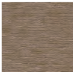
TR663 TAUPE REVERSIBLE