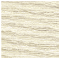
TR658 IVORY REVERSIBLE