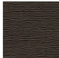
TR666 MILITARY REVERSIBLE