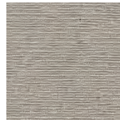
TR661 ICE REVERSIBLE