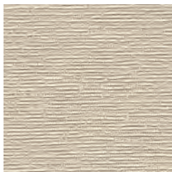
TR659 PEARL REVERSIBLE