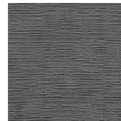
TR662 SILVER REVERSIBLE