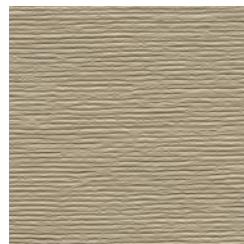
TR660 PALE GOLD REVERSIBLE