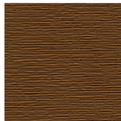
TR665 RED GOLD REVERSIBLE