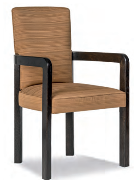
* CODE: 048295 RVIOB TR652, GRIMSEY FABRIC

Upholstered chair equipped with two solid wood side elements which serve as armrests, as well as structural support. The armrests are curved, and both the seat and the variable-density rubber backrest have a convex shape to ensure ergonomics. Elodea can be upholstered with all suitable Armani/Casa fabrics or Soft Touch Leathers in collection. A special version in Vintage Brown Oak features the upholstery also in Thin Leather. MADE IN ITALY.