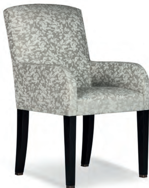
CODE: 048671 RMA0C TR712 (TALL SEATBACK), HELSINKI FABRIC

The Figaro chair is particularly comfortable, thanks to its soft padding and the inclined seat; moreover, the seat is higher than normal (cm 49,5). Figaro is available with tall or low backrest: the tall version better suits a dining table and has exactly the same height of the Dalia chair, so that both can be placed around the same table (Figaro at the ends, Dalia on the sides). Upholstery available in all suitable Armani/Casa fabrics or Soft Touch Leathers in collection. MADE IN ITALY.